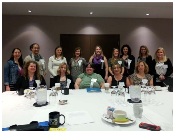
Chapter Delegates from across BC